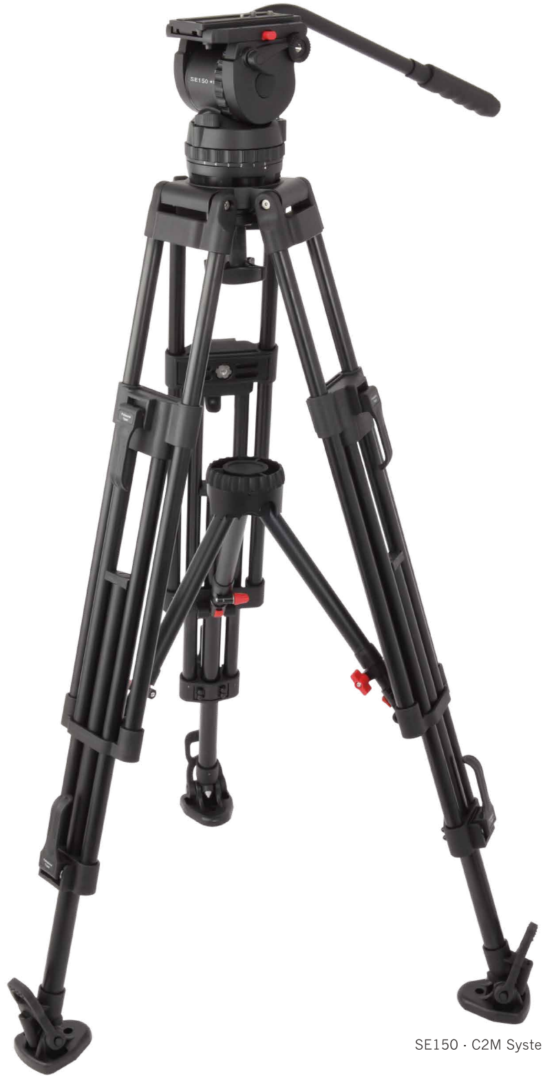
SE150 - C2M System

SE150 head + single fixed-length pan bar + 2-stage carbon tripod + mid-level spreader + soft carrying case.