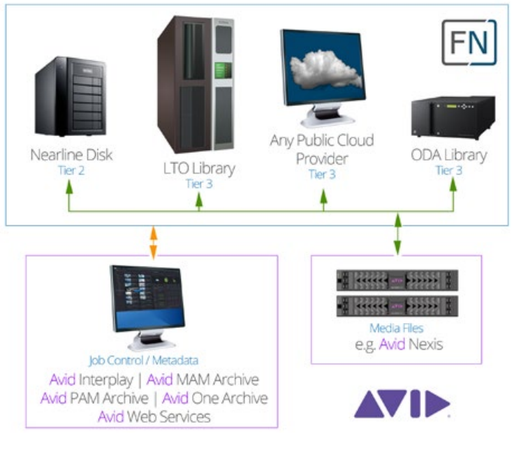
Whichever Avid<sup>®</sup> system you use, FlashNet provides seamless integration into cloud or on-prem archives